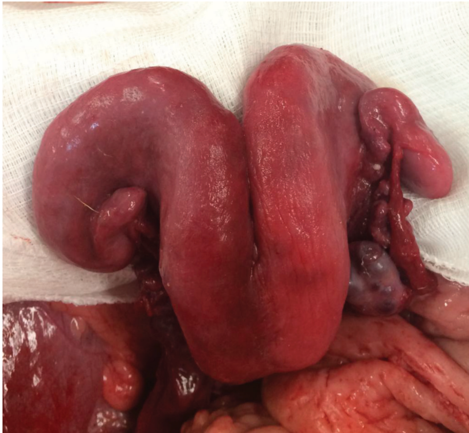
Figure 3 - Image of the uterus after reperfusion.

pigs, sheep and non-human primates. The first model in mice resulted in pregnancy (16) and offspring (17) after syngeneic uterine transplant. Following this success, the first pregnancies and offspring were demonstrated in rat allo-transplant models (18,19). Once the feasibility of uterine transplantation with immunosuppression was shown in small animals, attempts from the same research group were made in larger animals, beginning with pigs. However, their attempts were unsuccessful (20). In fact, this group also presented a high rate of vascular thrombosis in pig models (21), and thrombosis was only partially solved by utilizing a macrovascular patch that included the aorta and vena cava in the graft for anastomosis in a heterotopic uterine transplant model (22). Sheep were the next animal used as uterine transplant models. This animal has advantages over the swine model due to its similarities to the anatomy and size of the uterine vasculature in humans (23). The Brännström group developed an auto-transplant model with a single uterine horn vascularized pedicle anastomosed in the ipsilateral external iliac vessels (24), and they achieved live births (25) using this technique.